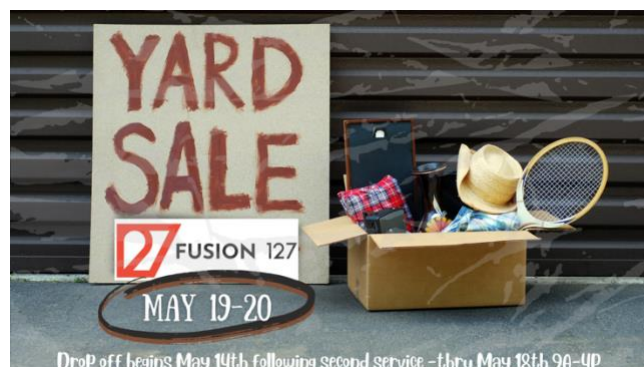
Drop off begins May 14th following second service - thru May 18th 9A-4P

We will be holding our annual Youth Yard Sale on May 19-20 and we need your help! Please start gathering your donations and dropping them off starting May 14 following second service, and for the